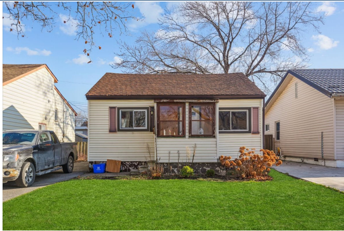
276 Ivon Ave. Hamilton, ON L8H 5T2